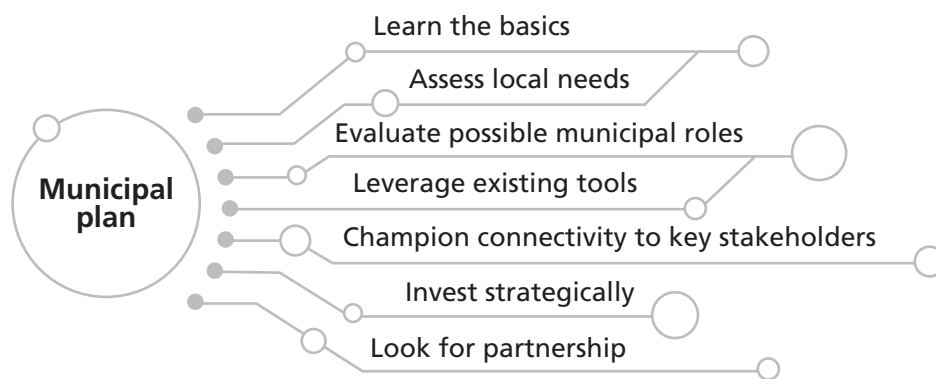
Figure 1: Components of a Municipal Roadmap (ROMA, 2020)

The Roadmap is not a linear pathway toward connectivity, but rather a set of components that councils can consider as it determines what is most helpful for their community (see Figure 1). It is not linear because some components will take longer than others, while others may need to be repeated based on changing local circumstances. Timing is another layer. While some components should start in the short-term, it does not suggest that all others should happen in sequence.